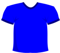
t- sh irt